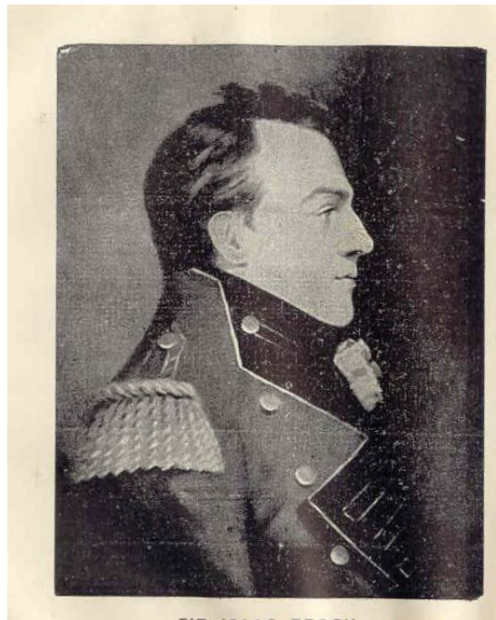
SIR ISAAC BROCK