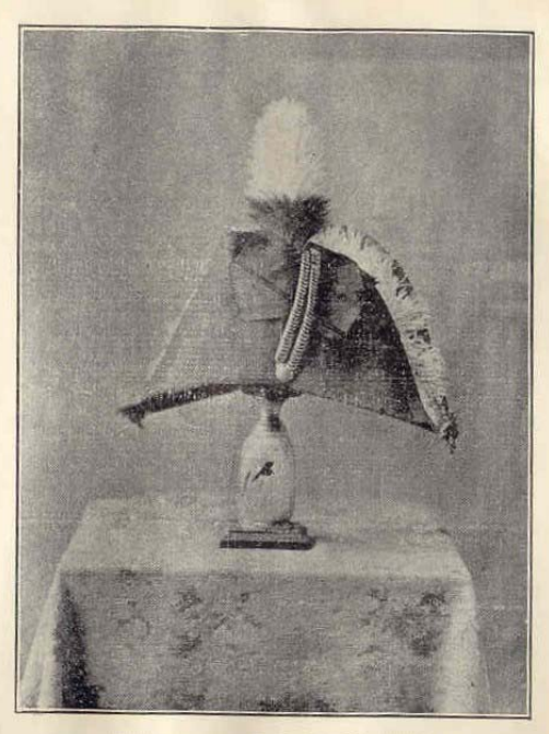
COCKED HAT OF GEN, BROCK