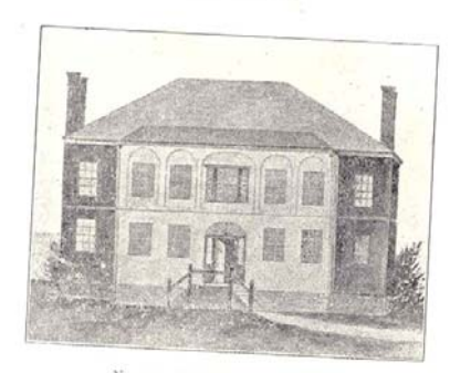
NIACARA COURT HOUSE AND JAIL.