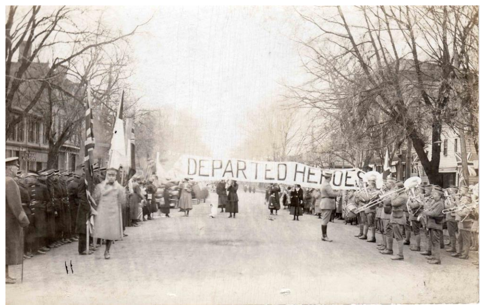
Armistice Parade - Photo: Niagara Historical Society & Museum