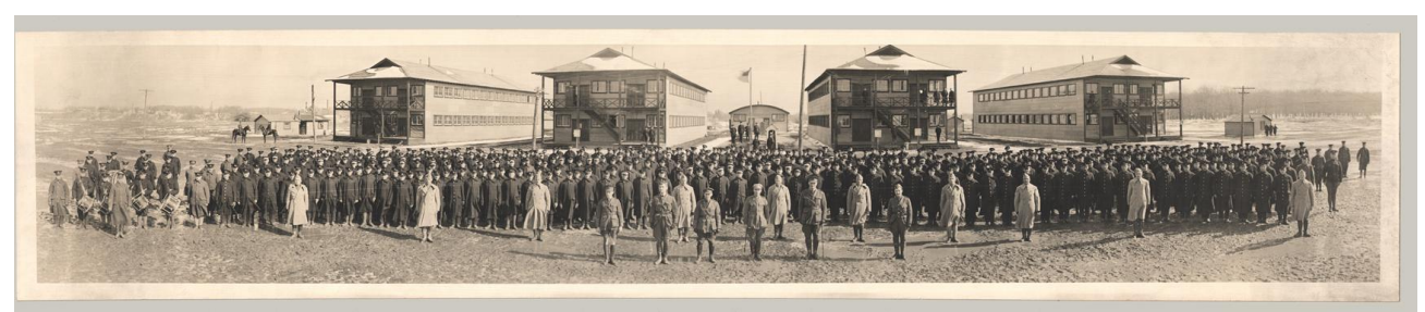
Panorama of Polish Camp, including four 'huts'; Photo: Niagara Historical Society and Museum

buildings on Melville street, in which were baths and other toilet conveniences for the use of the troops, will be sold as they stand, the purchaser to remove them without delay, but of these more will be known within the next few days. All the troops now remaining and who go to France in a few days are quartered in the big huts on the camp ground.