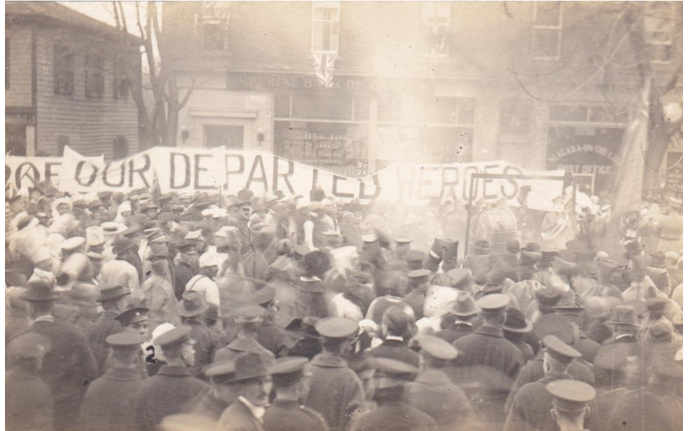
Armistice Parade, Burning the Kaiser in Effigy