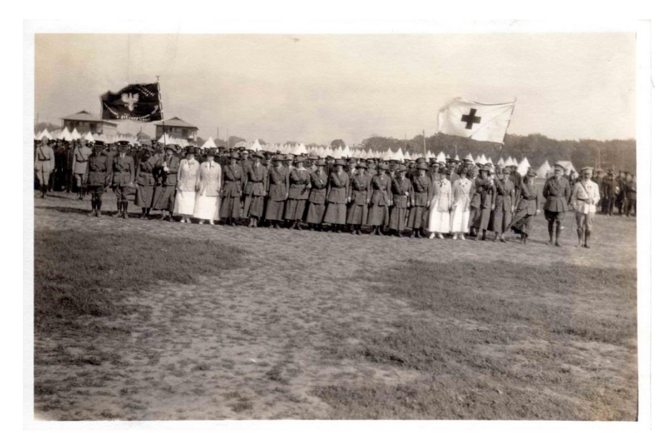
Polish Women's Army Corps and Red Cross

A garrison court of inquiry headed by Lt.-Col. Turnbull of the Welland Canal Force will sit soon to investigate a fire which occurred in one of the buildings occupied by the Polish Contingent at Niagara-on-the-Lake on Monday.