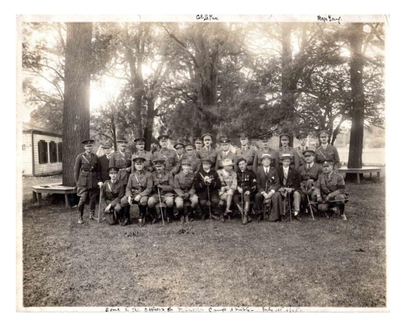
Officers at the Camp