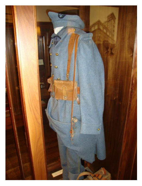
Polish Blue Army Uniform From the Collections of the Polish Museum of America, Chicago