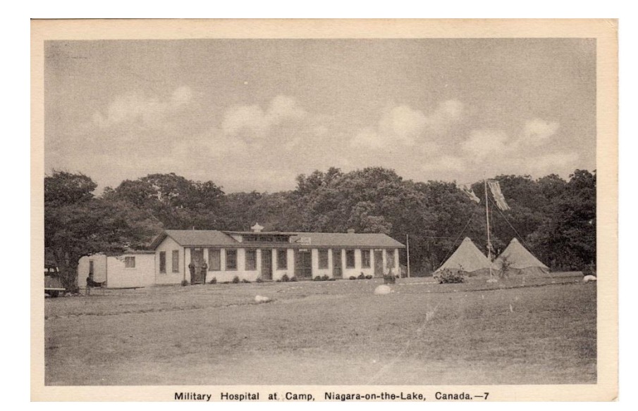
Camp Hospital, Niagara Camp