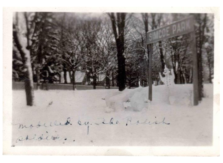
Snow Sculptures, Simcoe Park