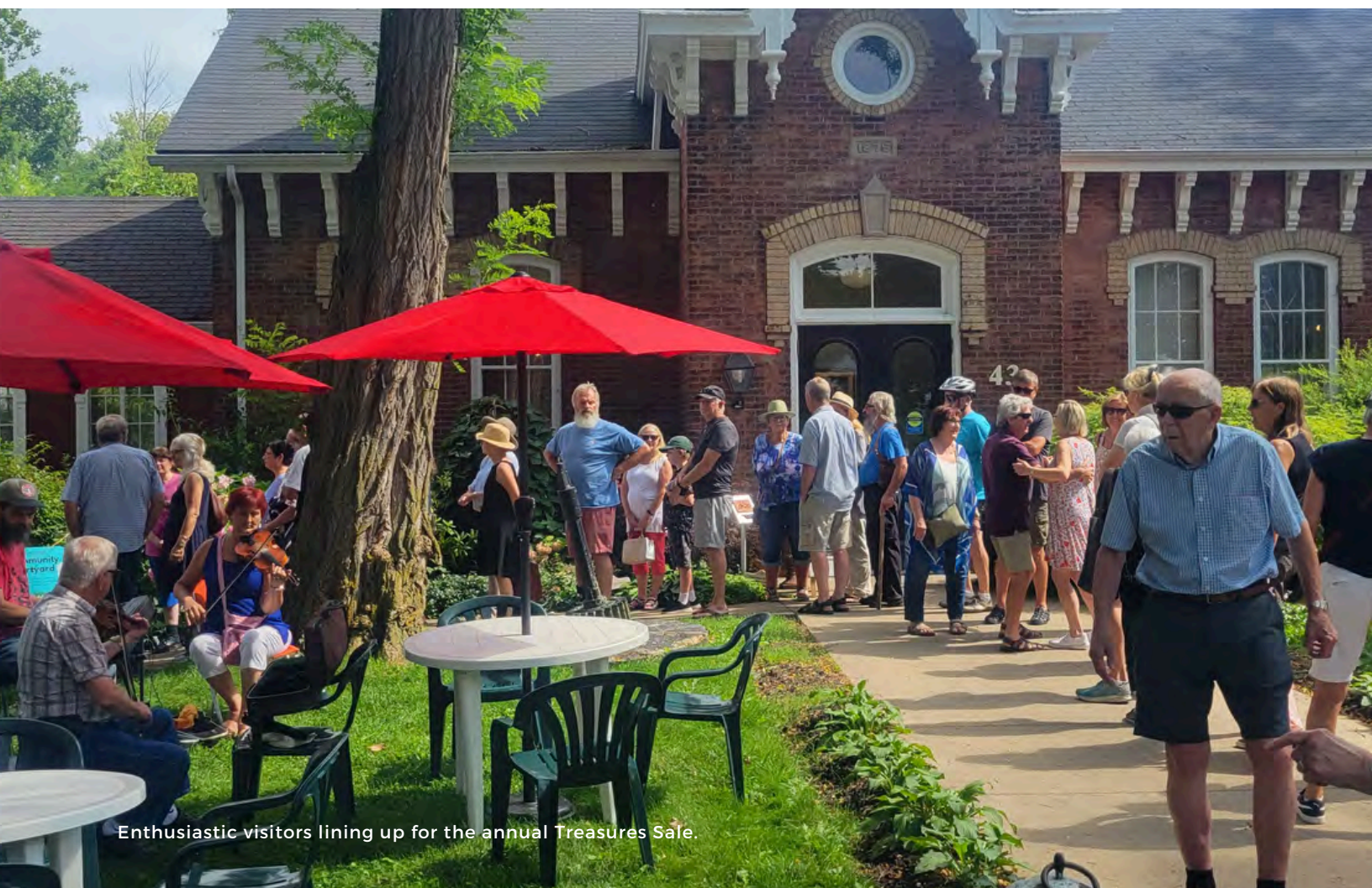
Enthusiastic visitors lining up for the annual Treasures Sale.