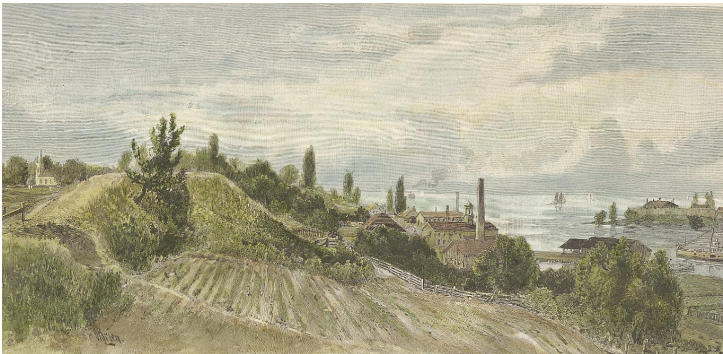
Print of the mouth of the Niagara River from the ramparts of Fort George. An illustration from Picturesque Canada, circa 1882. To the left of the illustration is St. Vincent de Paul Church, towards the right of centre is the dock area and the far right shows Fort Niagara.