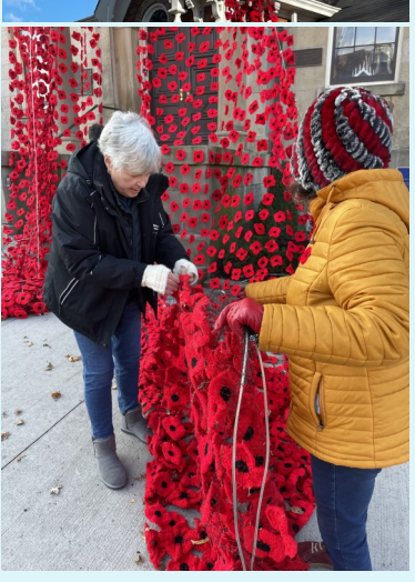
Photos: Installing the poppies at the Museum and the Court House; Poppies all laid out to dry.